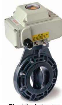
Electric Actuator Butterfly Valve