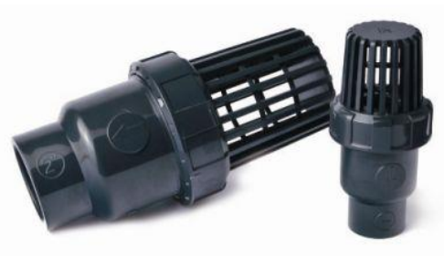
PVC Foot Valve