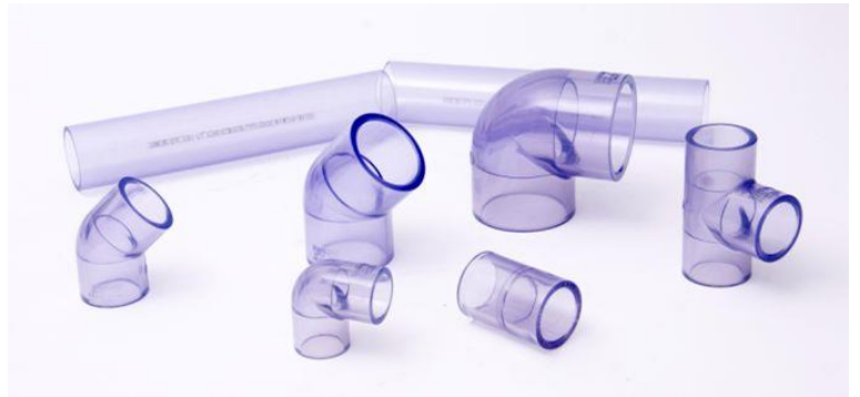
2.1.6 CL Series – Clear PVC Industrial Piping Systems