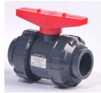
PVC True Union Ball Valve E Type