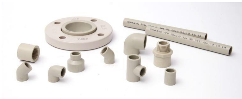
2.1.9 PP Series – PPH Industrial Piping Systems