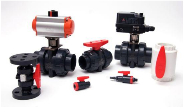
2.1.1 KV Series – Ball Valves