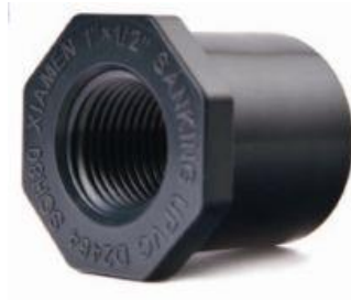
Reducing Bushing(SxT) 1/2" x 1/4" ~ 1" x 3/4"