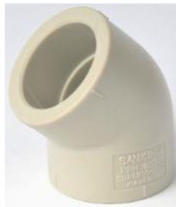
PPH 45 Degree Elbow(SxS)