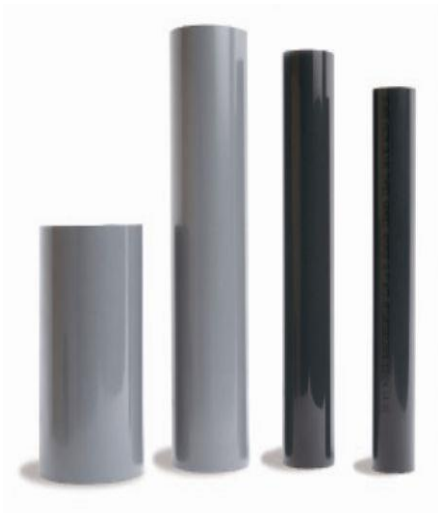
PVC,CPVC Pipe(SCH80/SCH40, PN16/PN10)