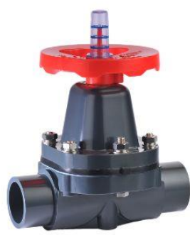
Socket Diaphragm Valve