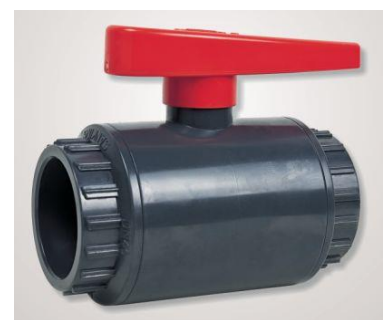
3G (third generation) Compact Ball Valve