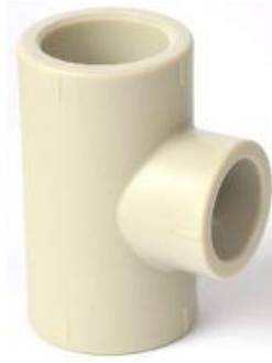
PPH Reducing Tee(SxSxS)