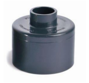
Reducing Socket(SxS) 3/4" x 1/2" ~ 2" x 1-1/2"