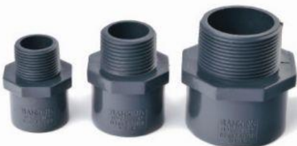
Male Adapter(SxT) 1/2" ~ 2" (20mm - 63mm)