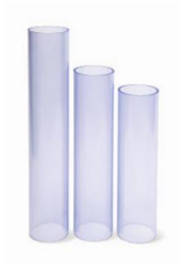
Clear PVC Pipe SCH40