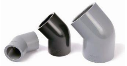
45 Degree Elbow 1/2" ~ 12" (20mm - 315mm)