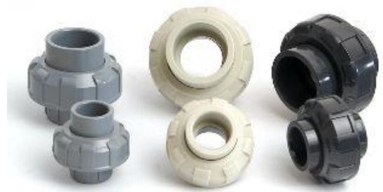
PVC / CPVC / PPH Union 1/2" ~ 4" (20mm - 110mm)