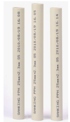
PPH Pipe DIN