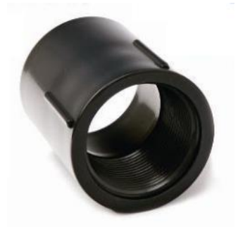
Socket(TxT) 1/2" ~ 12"(20mm - 315mm)