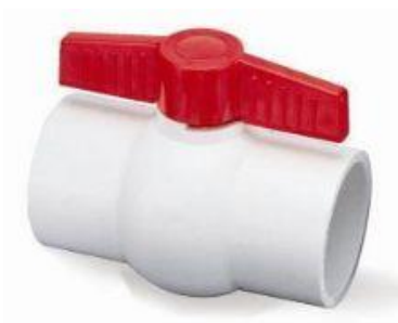
"Old" Compact Ball Valve