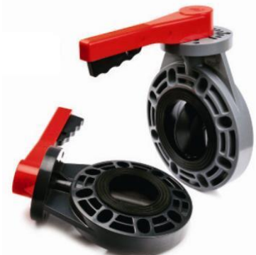
Butterfly Valve(Handle Level Type)