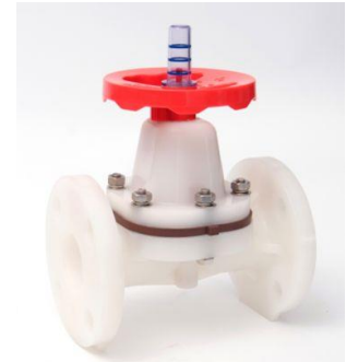
PVDF Diaphragm Valve