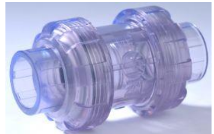
Clear PVC Ball Check Valve