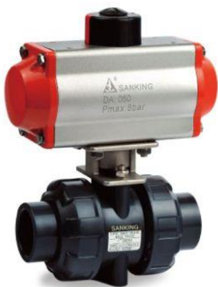
Pneumatic Actuated Ball Valve