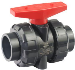
PVC True Union Ball Valve