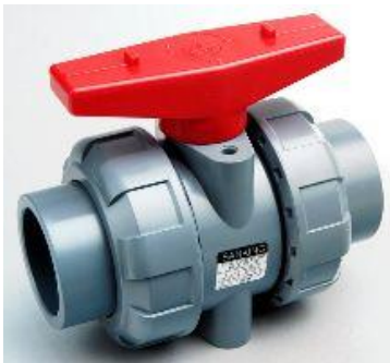
CPVC True Union Ball Valve