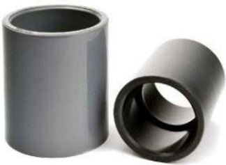
Coupling (SxS) 1/2" ~ 12" (20mm - 315mm)