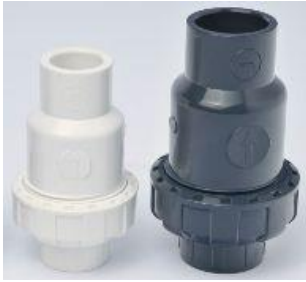
PVC / CPVC / PP New Check Valve