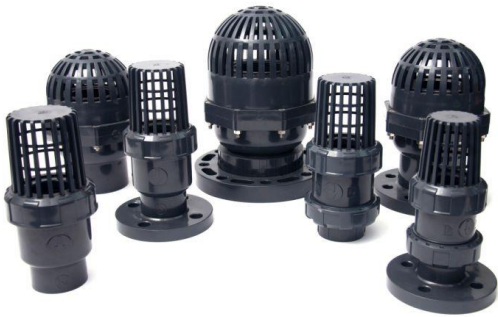
2.1.5 KJV Series – Foot Valves