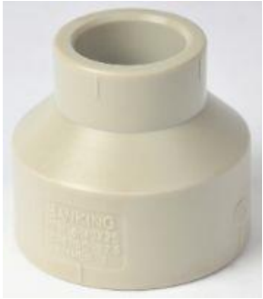
PPH Reducing Socket(SxS)