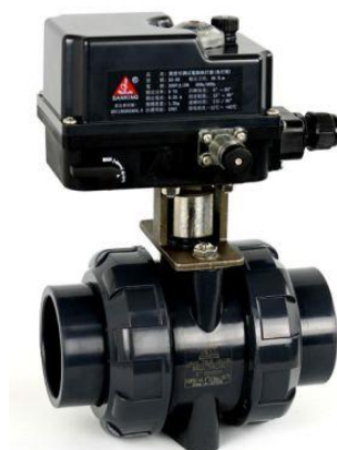
Electric Actuated Ball Valve