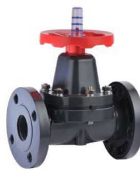
Flanged Diaphragm Valve