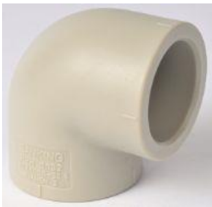
PPH 90 Degree Elbow(SxS)