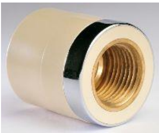
Brass Female Elbow(SxT) 1/2" ~ 4" (20mm - 110mm)