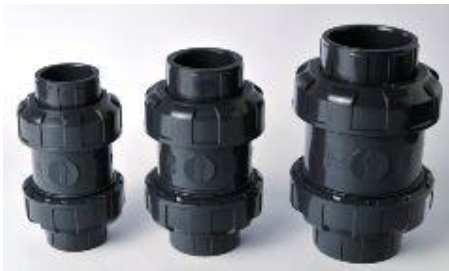
PVC/ PP Ball Check Valve