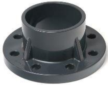
PVC / CPVC T/S Flange 1/2" ~ 8" (20mm - 225mm)