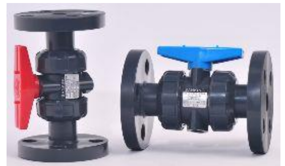
PVC / CPVC / PPH Flanged Ball Valve