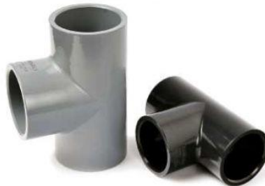
Tee(SxS) 1/2" ~ 12" (20mm - 315mm)