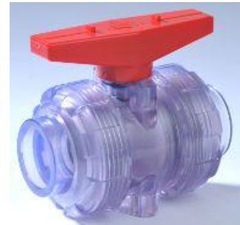
Clear PVC True Union Ball Valve