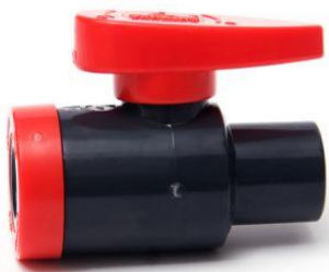
4G Compact Ball Valve