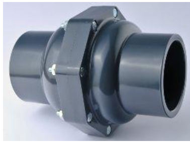
PVC / CPVC Swing Check Valve