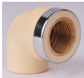
90 Degree Brass Female Elbow(SxT) 1/2" ~ 4" (20mm - 110mm)