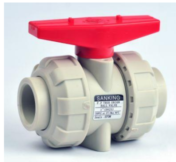
PP True Union Ball Valve