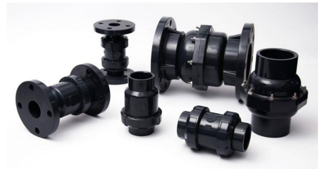
2.1.4 KCV Series – Check Valves