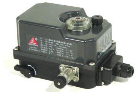
New Electric Actuator