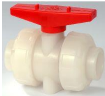
PVDF True Union Ball Valve