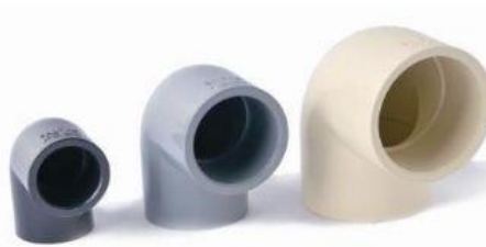
90 Degree Elbow(SxS,SxT) 1/2" ~ 12" (20mm - 315mm)