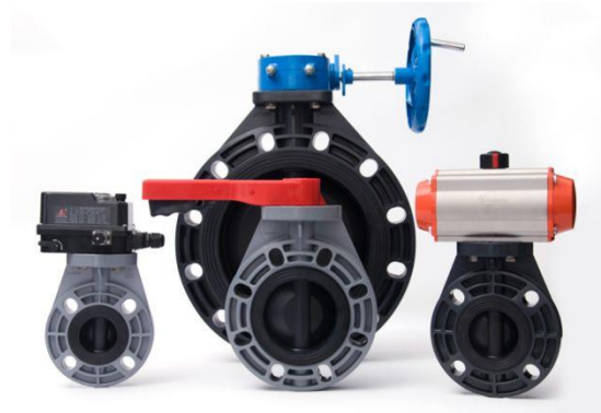
2.1.2 KBV Series – Butterfly Valves