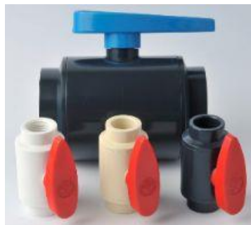
New Compact Ball Valve