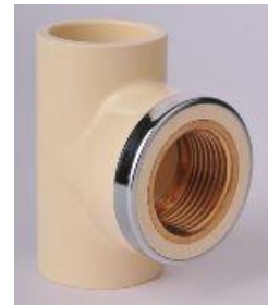
Brass Female Tee(SxSxT) 1/2" ~ 4" (20mm - 110mm)