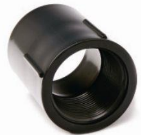
Female Adapter(SxT) 1/2" ~ 2" (20mm - 63mm)