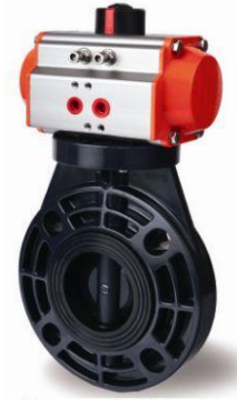
Pneumatic Actuator Butterfly Valve