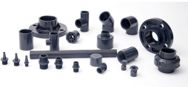
2.1.7 UP Series – UPVC Industrial Piping Systems