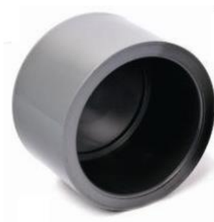
Cap(SxS) 1/2" ~ 4" (20mm - 110mm)