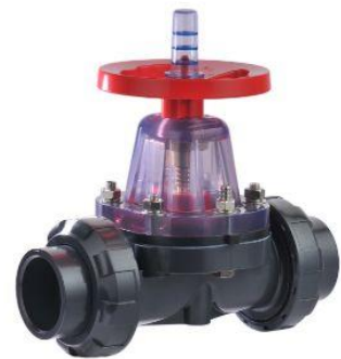
True Union Diaphragm Valve