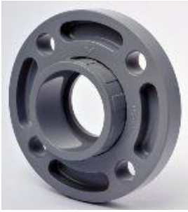
PVC / CPVC V/S Flange 1/2" ~ 12" (20mm - 315mm)