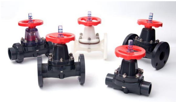
2.1.3 KDV Series – Diaphragm Valves