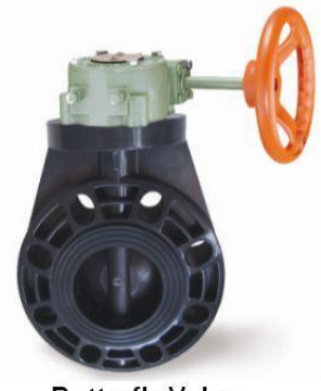
Butterfly Valve (Worm Gear Type)