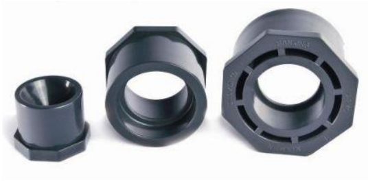
Reducing Bushing(SxS) 3/4" x 1/2" ~ 8" x 6"