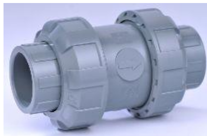
CPVC Ball Check Valve