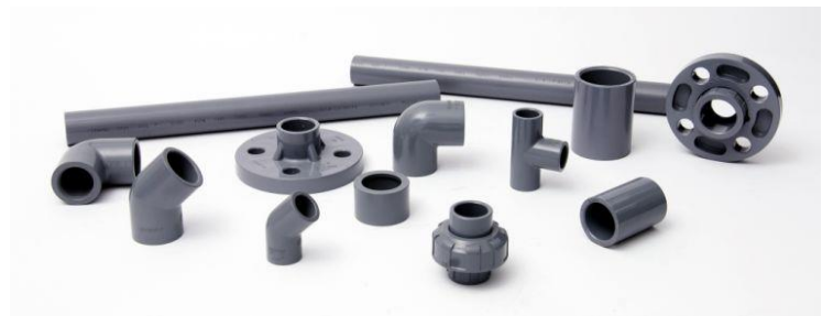
2.1.8 CP Series – CPVC Industrial Piping Systems