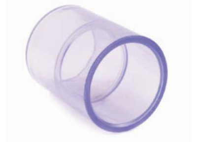
Clear PVC Coupling(SxS)