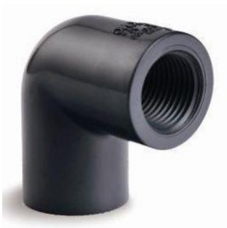
90 Degree Elbow(TxT)