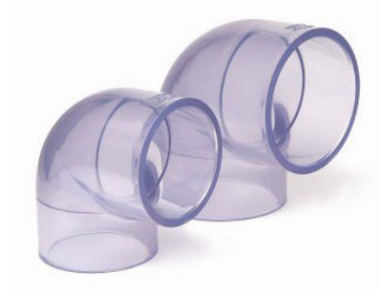
Clear PVC 90 Degree Elbow(SxS)