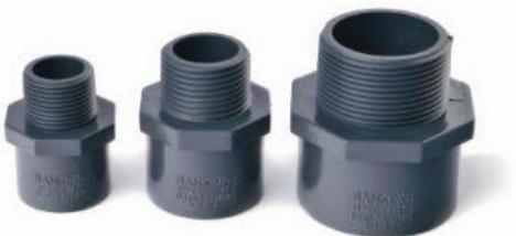
Male Adapter(SxT) 1/2" ~ 2" (20mm - 63mm)