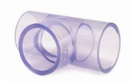
Clear PVC Tee(SxSxS)